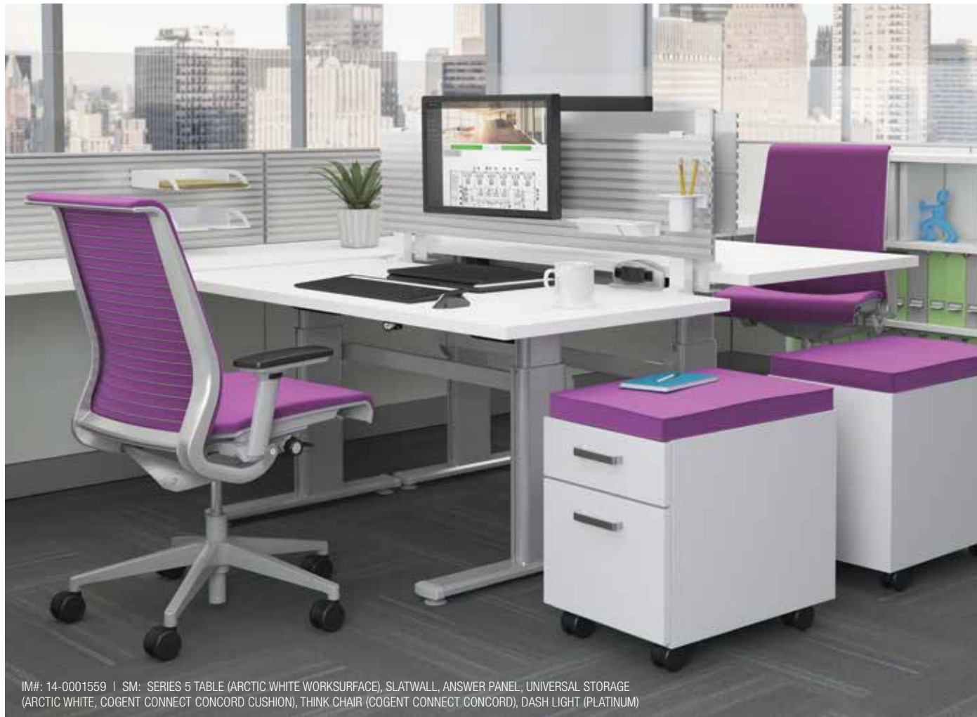
IM#: 14-0001559 | SM: SERIES 5 TABLE (ARCTIC WHITE WORKSURFACE), SLATWALL, ANSWER PANEL, UNIVERSAL STORAGE (ARCTIC WHITE, COGENT CONNECT CONCORD CUSHION), THINK CHAIR (COGENT CONNECT CONCORD), DASH LIGHT (PLATINUM)