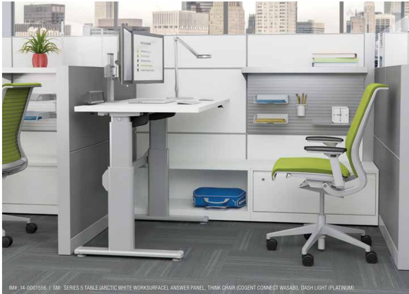
IM#: 14-0001556 | SM: SERIES 5 TABLE (ARCTIC WHITE WORKSURFACE), ANSWER PANEL, THINK CHAIR (COGENT CONNECT WASABI), DASH LIGHT (PLATINUM)