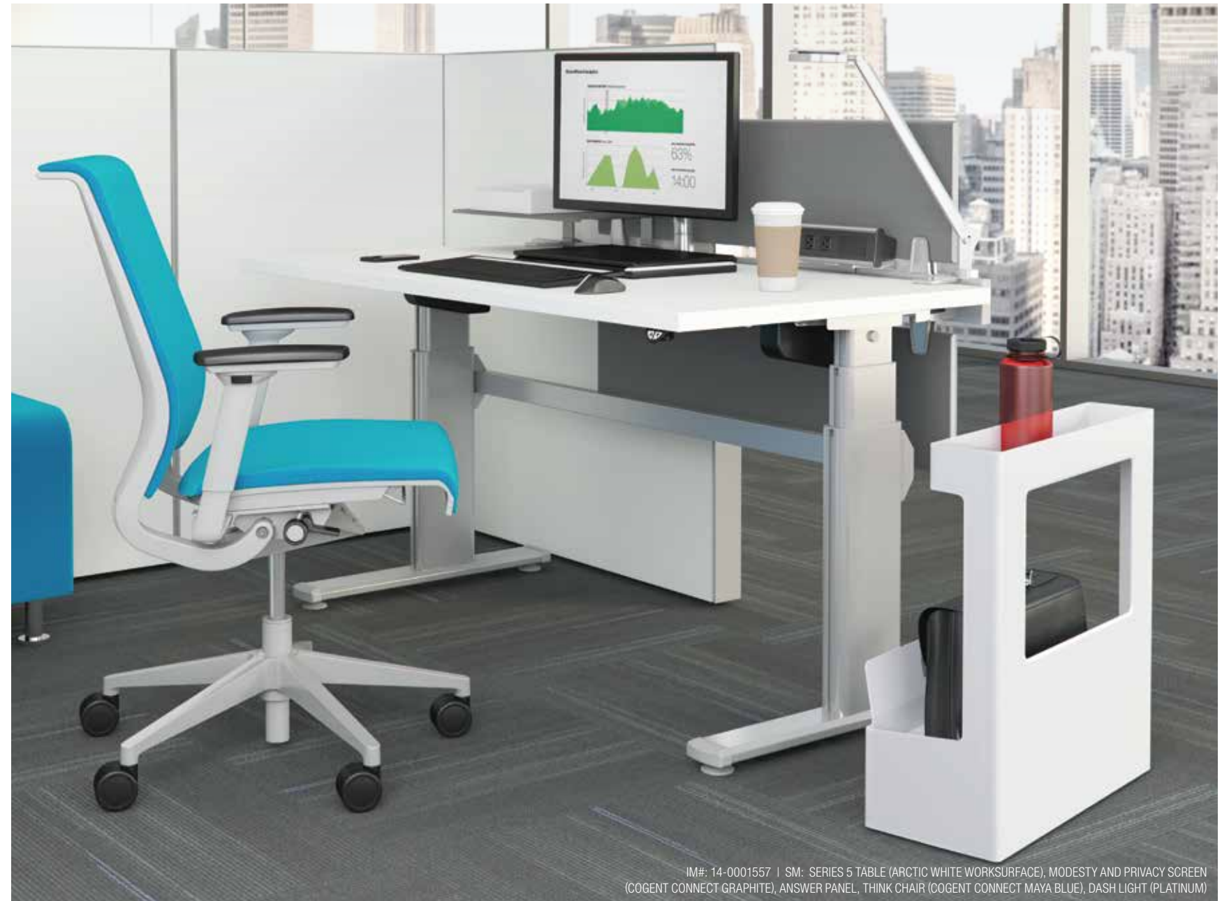
IM#: 14-0001557 | SM: SERIES 5 TABLE (ARCTIC WHITE WORKSURFACE), MODESTY AND PRIVACY SCREEN (COGENT CONNECT GRAPHITE), ANSWER PANEL, THINK CHAIR (COGENT CONNECT MAYA BLUE), DASH LIGHT (PLATINUM)

With the push of a button, Series 5 worksurfaces effortlessly adjust up or down, creating a comfortable and productive workspace—whether sitting or standing, working independently, collaborating, or touching down temporarily.