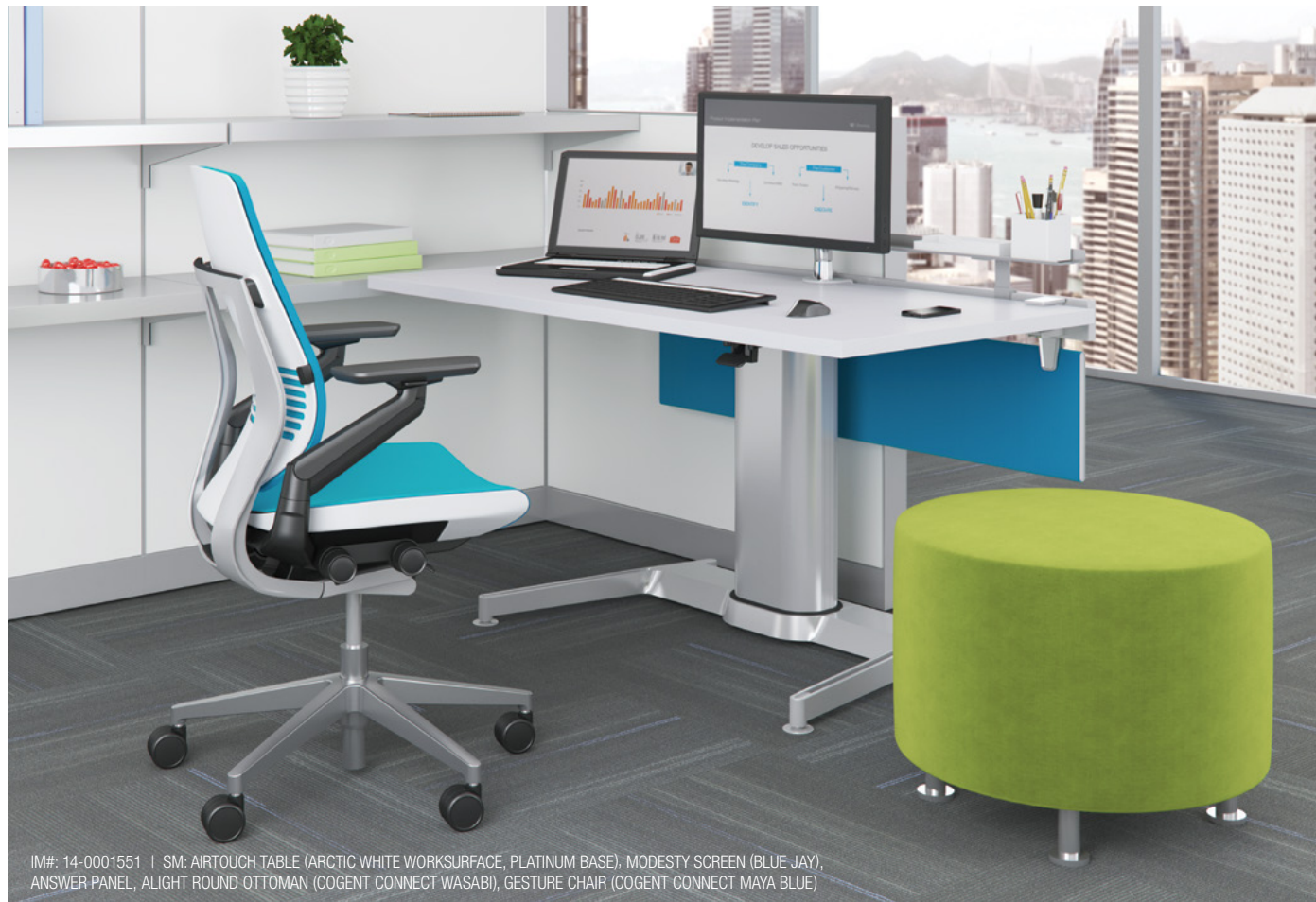
IM#: 14-0001551 | SM: AIRTOUCH TABLE (ARCTIC WHITE WORKSURFACE, PLATINUM BASE), MODESTY SCREEN (BLUE JAY), ANSWER PANEL, ALIGHT ROUND OTTOMAN (COGENT CONNECT WASABI), GESTURE CHAIR (COGENT CONNECT MAYA BLUE)