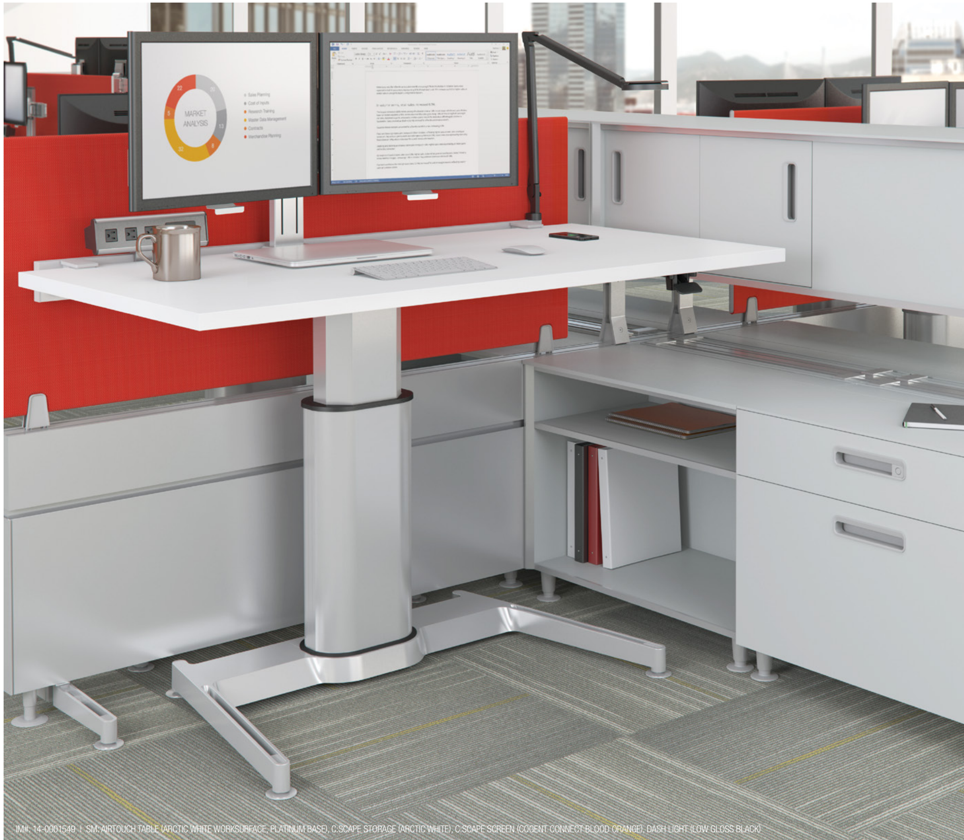
IM#: 14-0001549 | SM: AIRTOUCH TABLE (ARCTIC WHITE WORKSURFACE, PLATINUM BASE), C-SCAPE STORAGE (ARCTIC WHITE), C-SCAPE SCREEN (COGENT CONNECT BLOOD ORANGE), DASH LIGHT (LOW GLOSS BLACK)