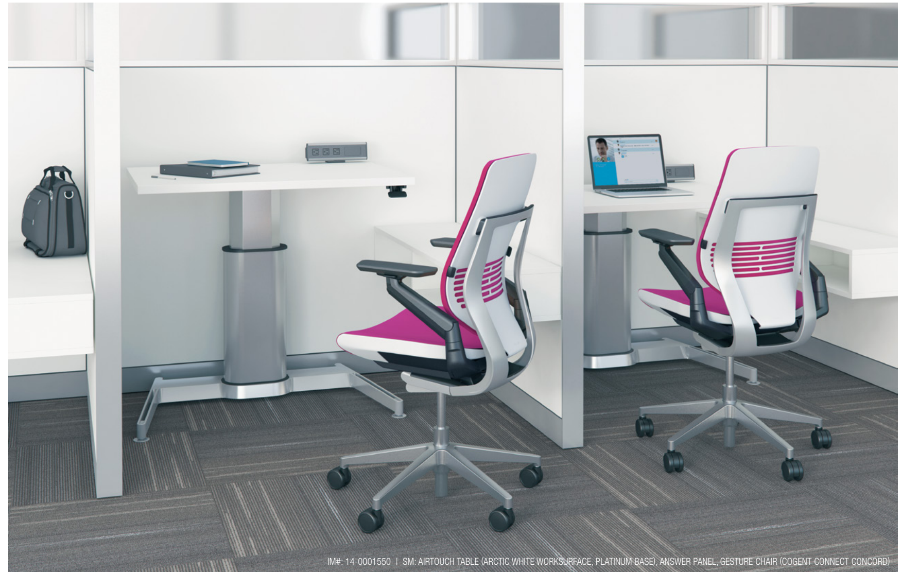
IM#: 14-0001550 | SM: AIRTOUCH TABLE (ARCTIC WHITE WORKSURFACE, PLATINUM BASE), ANSWER PANEL, GESTURE CHAIR (COGENT CONNECT CONCORD)

Movement during the workday improves focus and energy while promoting collaboration and engagement. Airtouch can be used for seated individual work or raised to provide a quick, stand-up meeting surface.